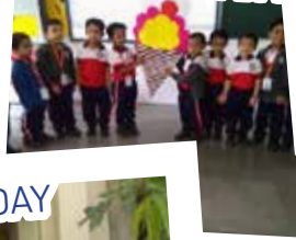
ICE CREAM DAY