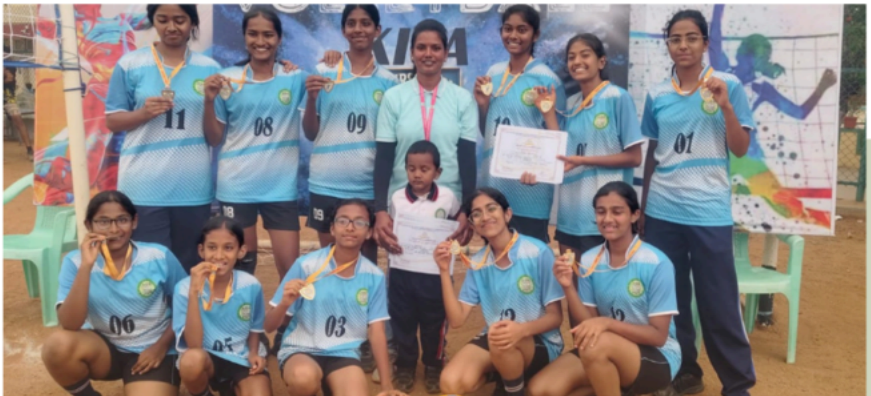
CISCE ZONAL LEVEL Under 17 Girls - 1 st Position