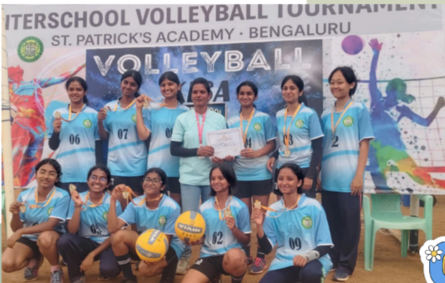
CISCE ZONAL LEVEL Under 19 Girls - 1 st Position