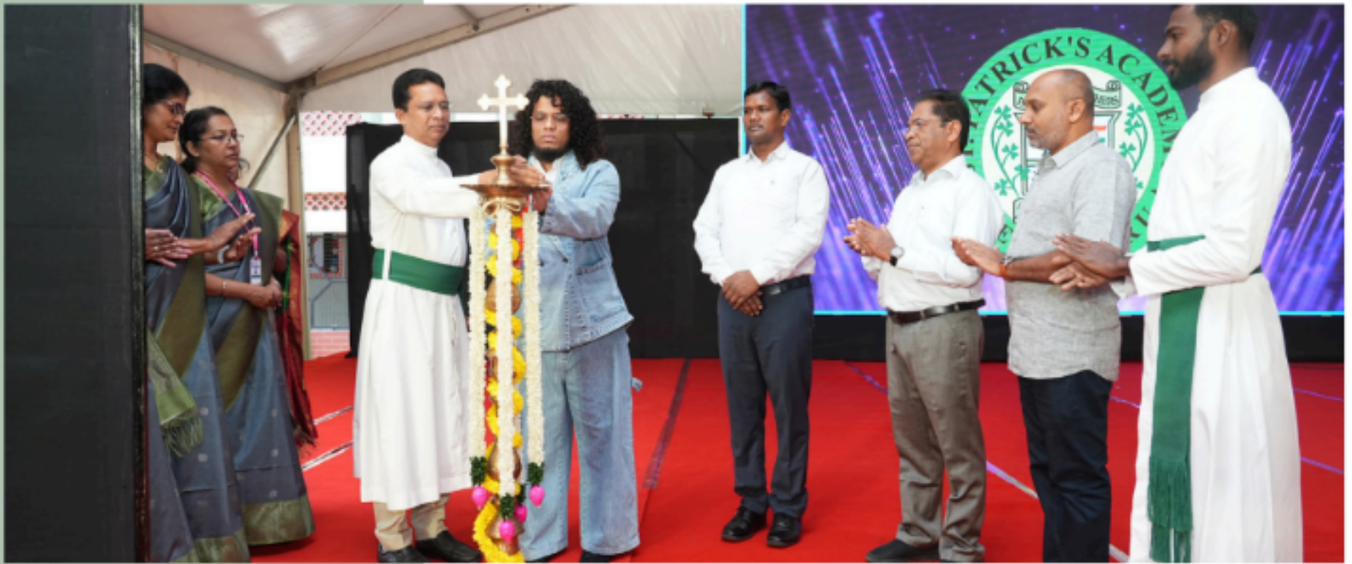
Cultural Kaleidoscope: IGNITE