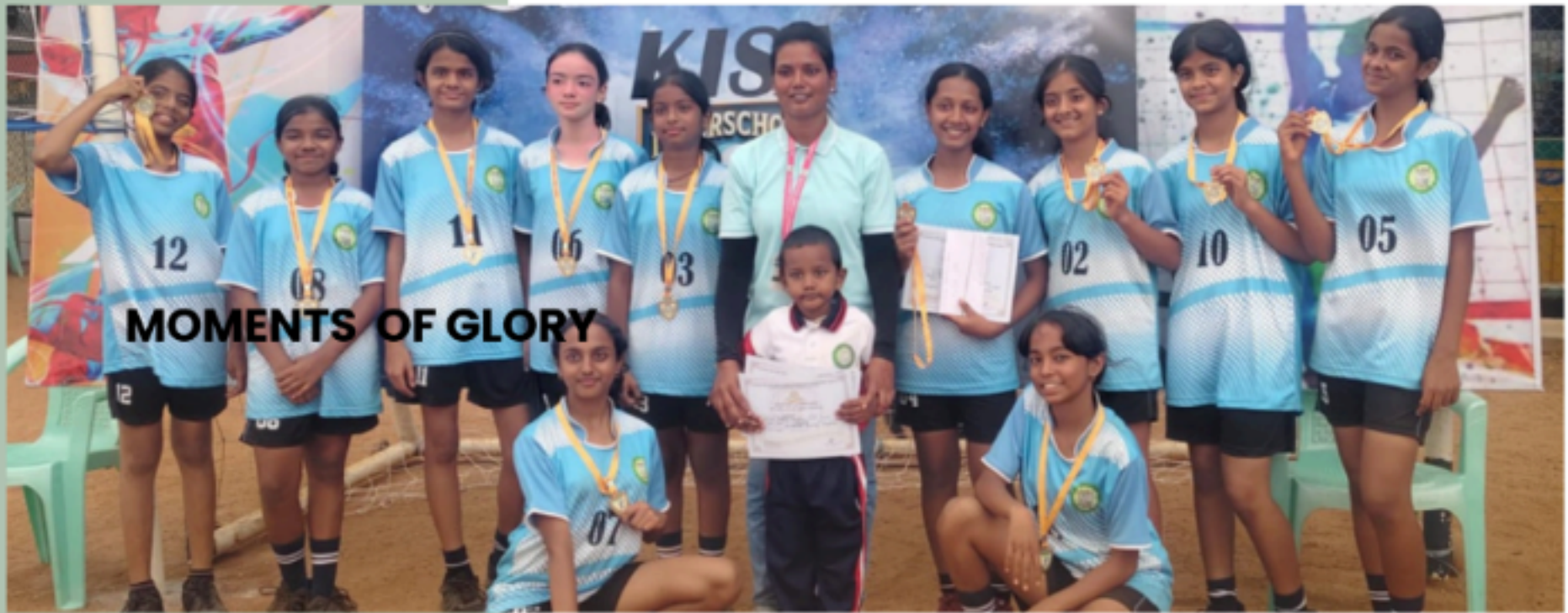
CISCE ZONAL LEVEL Under 14 Girls - 1 st Position