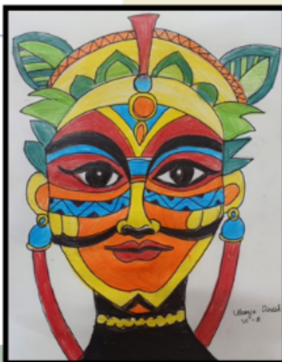
Udanya Dinesh VI D